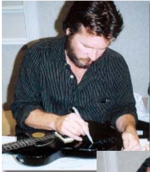
The biggest-name star ever to appear at the HCS, Val Kilmer came through big-time.

before his scheduled signing time – just to get an early jump on the huge crowd that greeted him throughout the day. Dressed casually in a long-sleeved colored shirt, Kilmer sported a full mustache and beard, much as he did in his