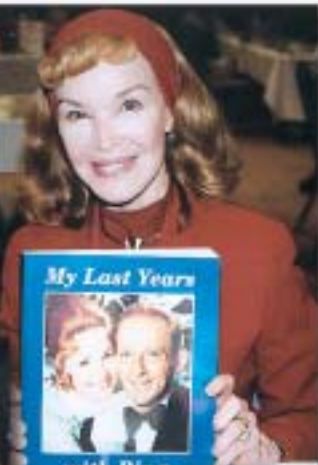
(Clockwise from top left) Charlene Tilton, Kathryn Crosby, Sybil Danning and Julie McCullough helped make this perhaps the best HCS event ever.