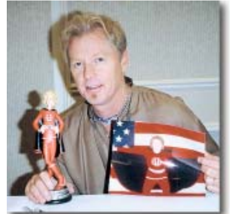
William Katt: The Greatest American Hero made a rare signing appearance and didn't disappoint.

Although Batman (Val Kilmer played the caped crusader in Batman Forever ) was the highlight of the show, many collectors were equally happy to meet The Greatest American Hero himself, William Katt . Making his first autograph